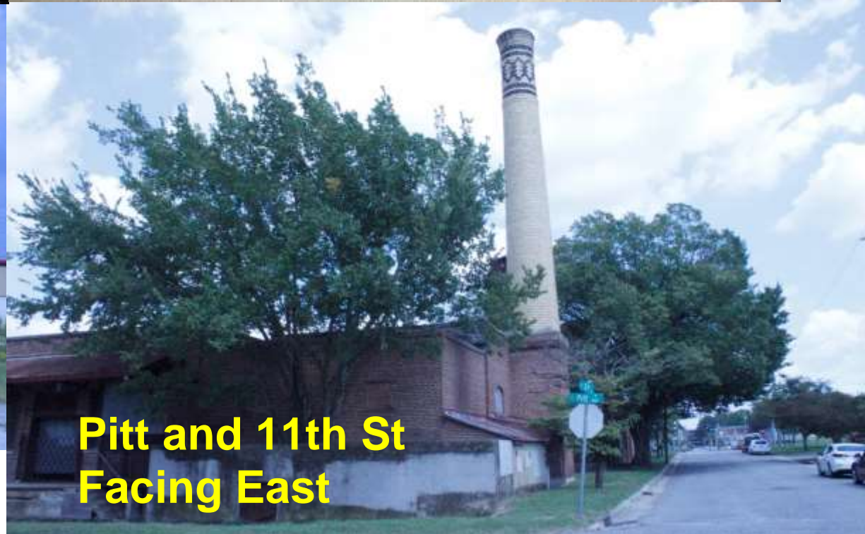
Pitt and 11th St Facing East