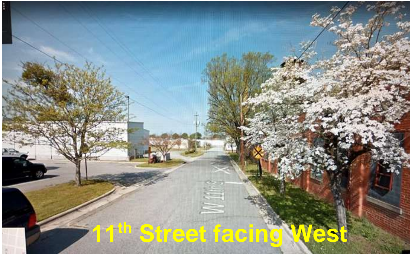
11 th Street facing West