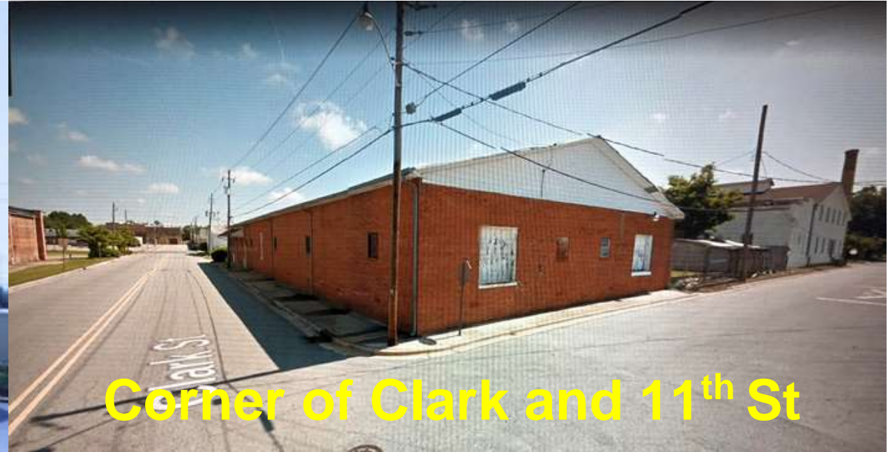
Corner of Clark and 11 th St