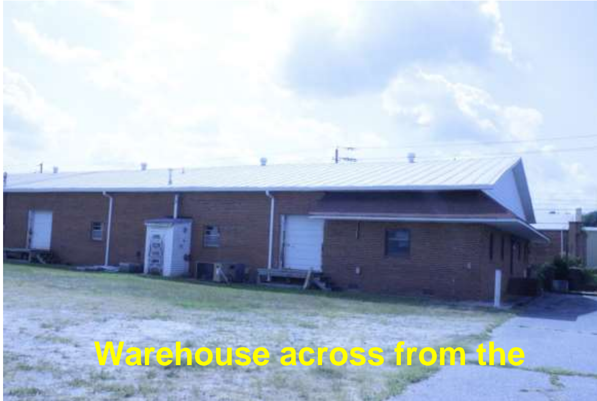
Warehouse across from the