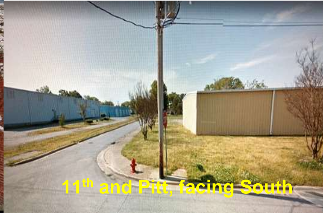
11 th and Pitt, facing South