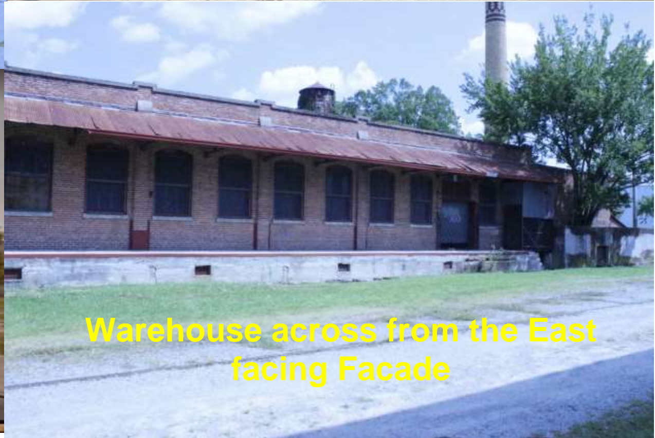
Warehouse across from the East facing Facade