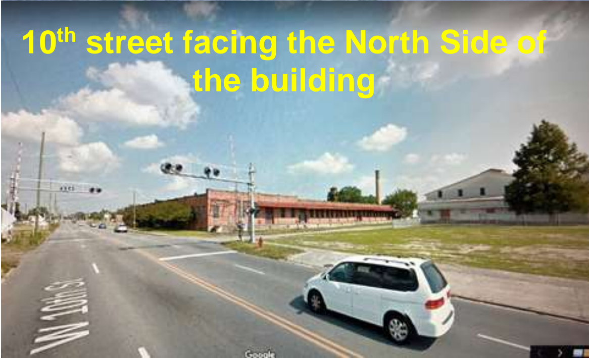
10 th street facing the North Side of the building