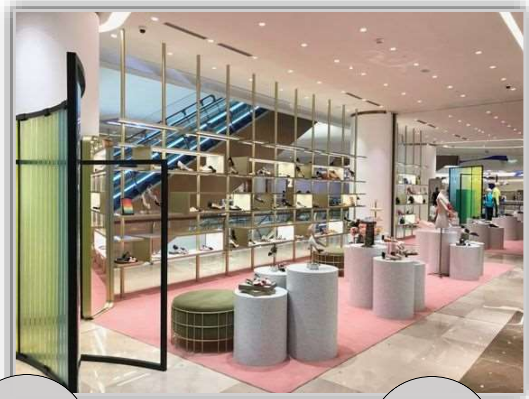
Abundant Showcasing for Product