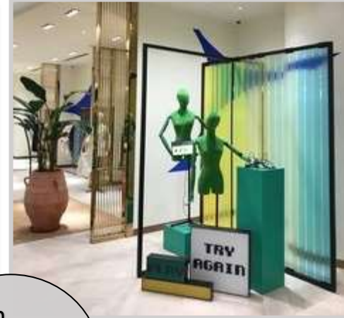
Open Floorplan for Easy Access