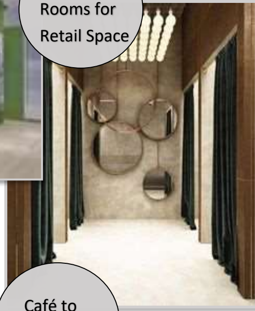
Dressing Rooms for Retail Space