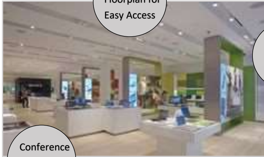
Conference Room for Business