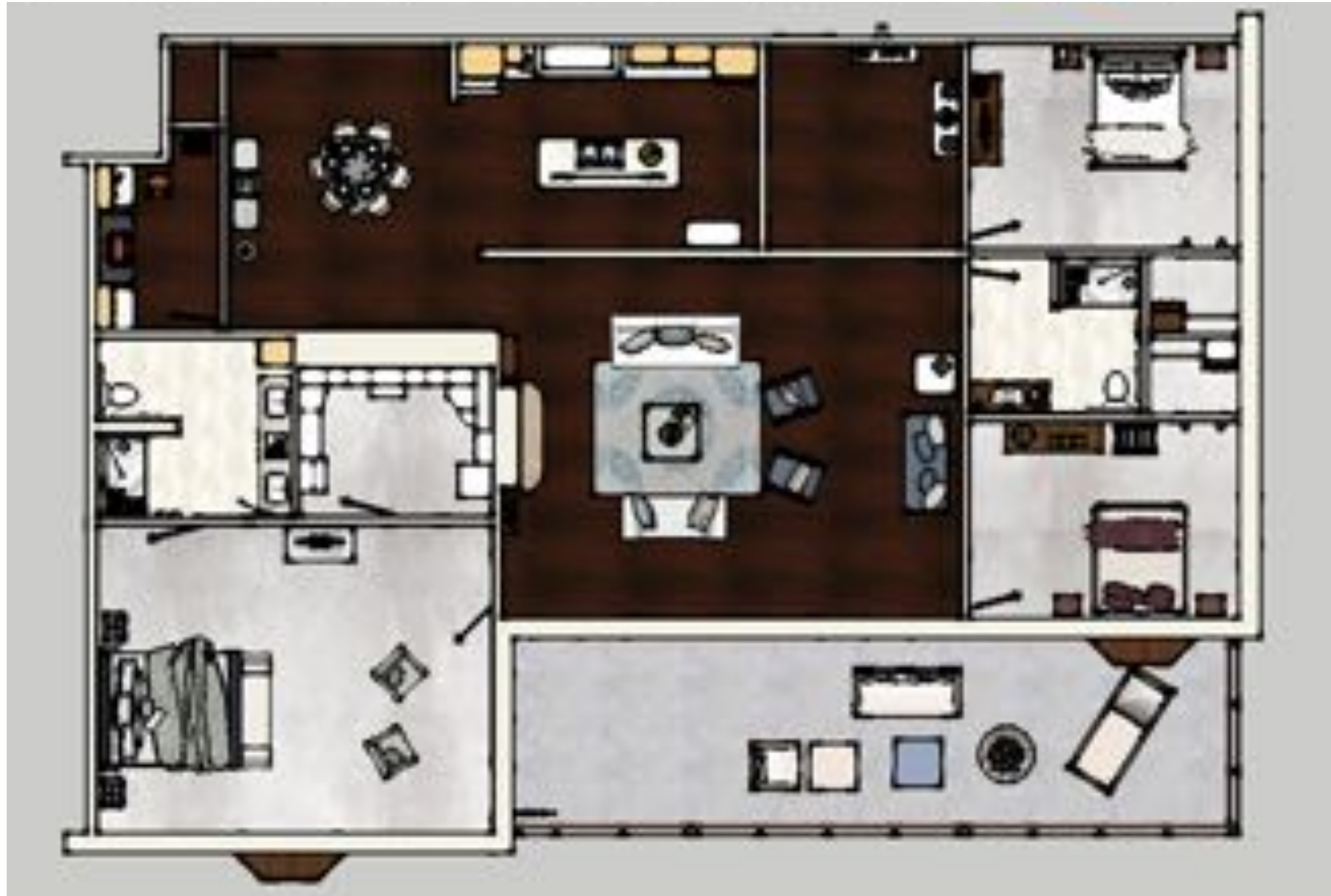
FINAL FLOOR PLAN