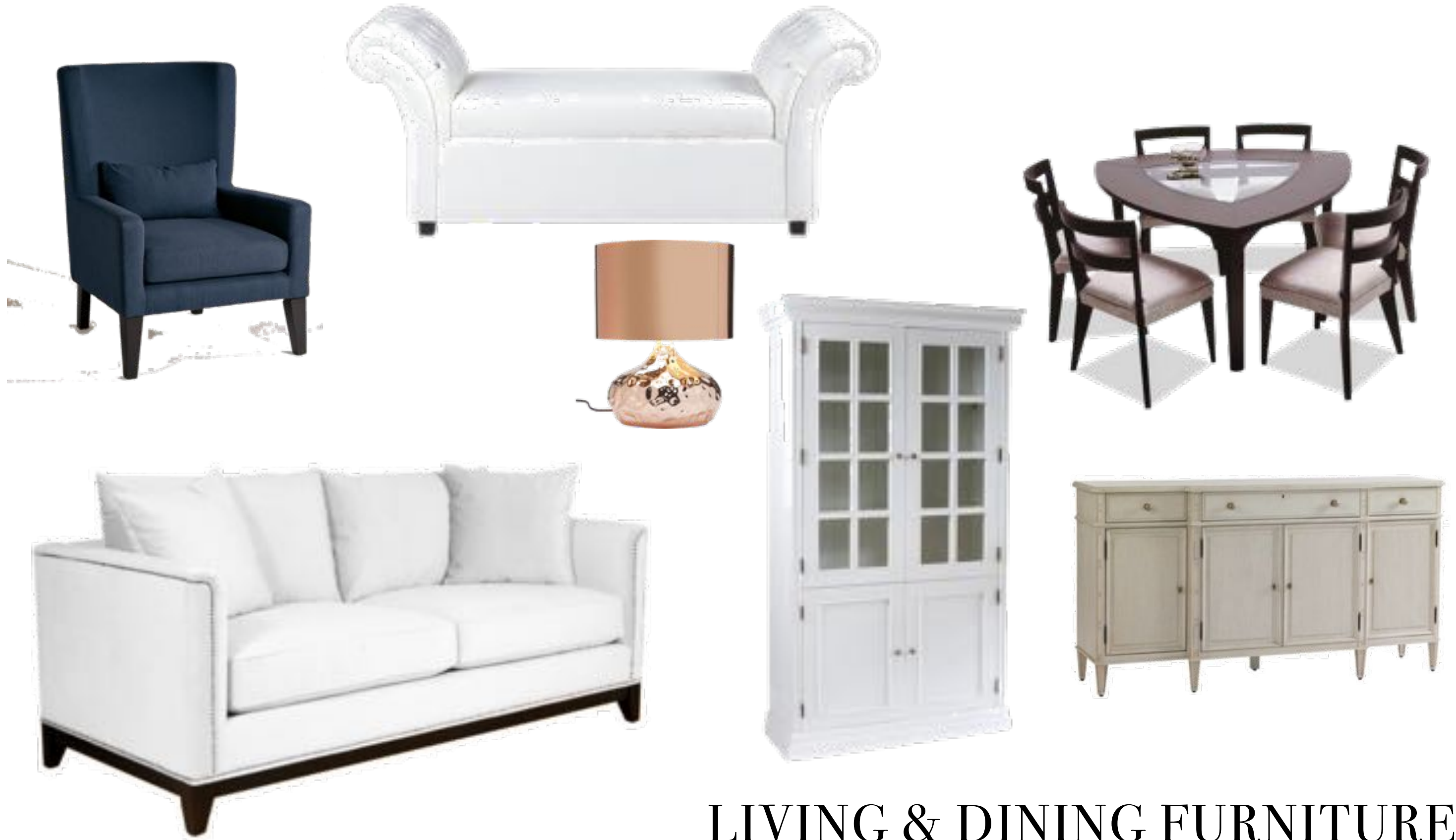
LIVING & DINING FURNITURE