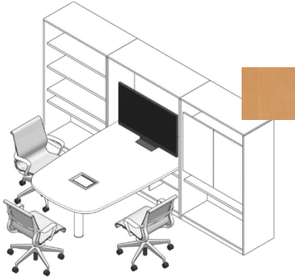
Herman Miller - Canvas Group - Storage + table