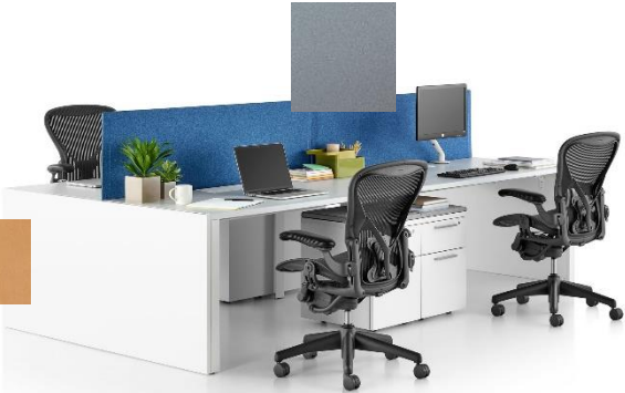
Herman Miller - Layout Studio - Flexible Benching Solution