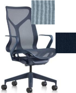
Herman Miller - Cosm - Work Chair