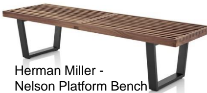
Herman Miller - Nelson Platform Bench