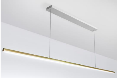
Vista Lighting – Rae 89”