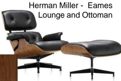
Herman Miller - Eames Lounge and Ottoman