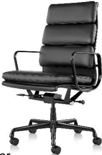
Herman Miller - Eames SoftPad Chair