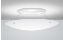
Vista Lighting – Button Accent