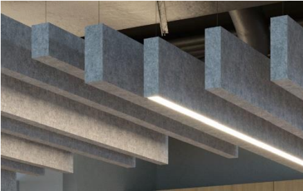
Tuff - Beam LED - Acoustic Ceiling Baffle