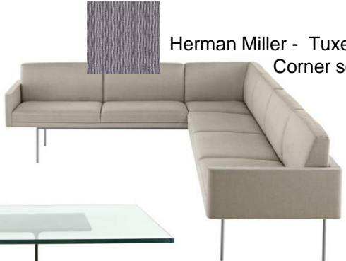
Herman Miller - Tuxedo Corner sofa