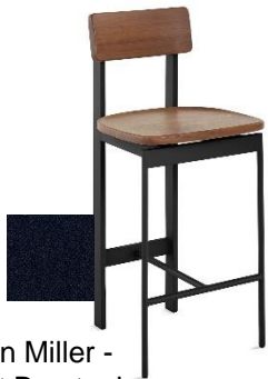
Herman Miller - Betwixt Barstool