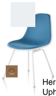
Herman Miller - Eames Upholstered Molded Side chair