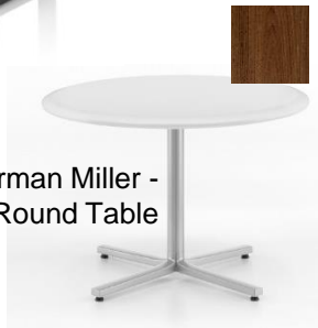
Herman Miller - Everywhere Round Table