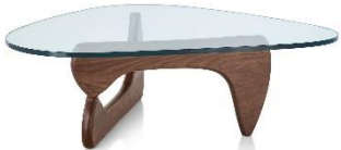
Herman Miller - Noguchi table