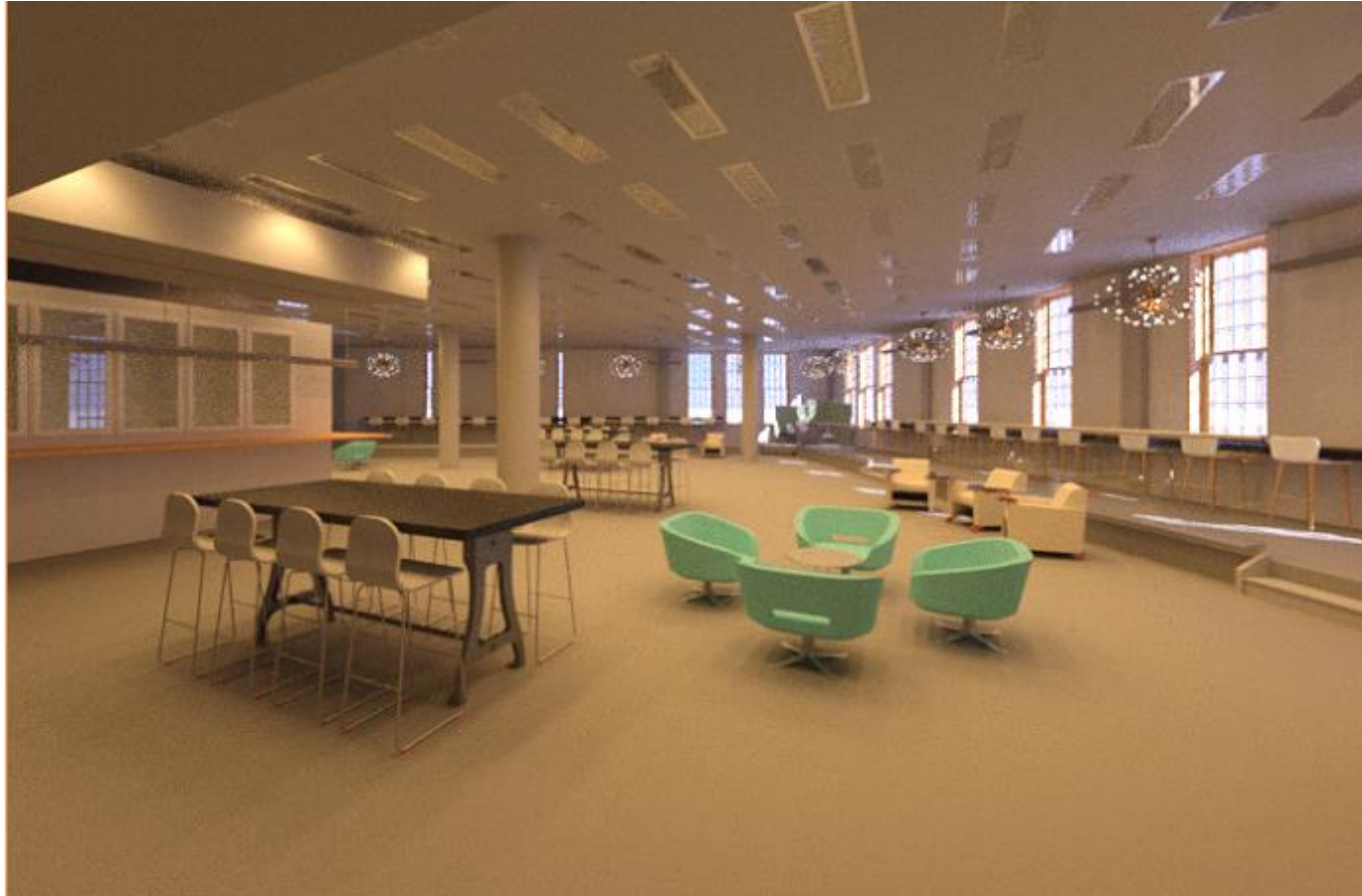
Rendered Flexible Work Areas/Event Space