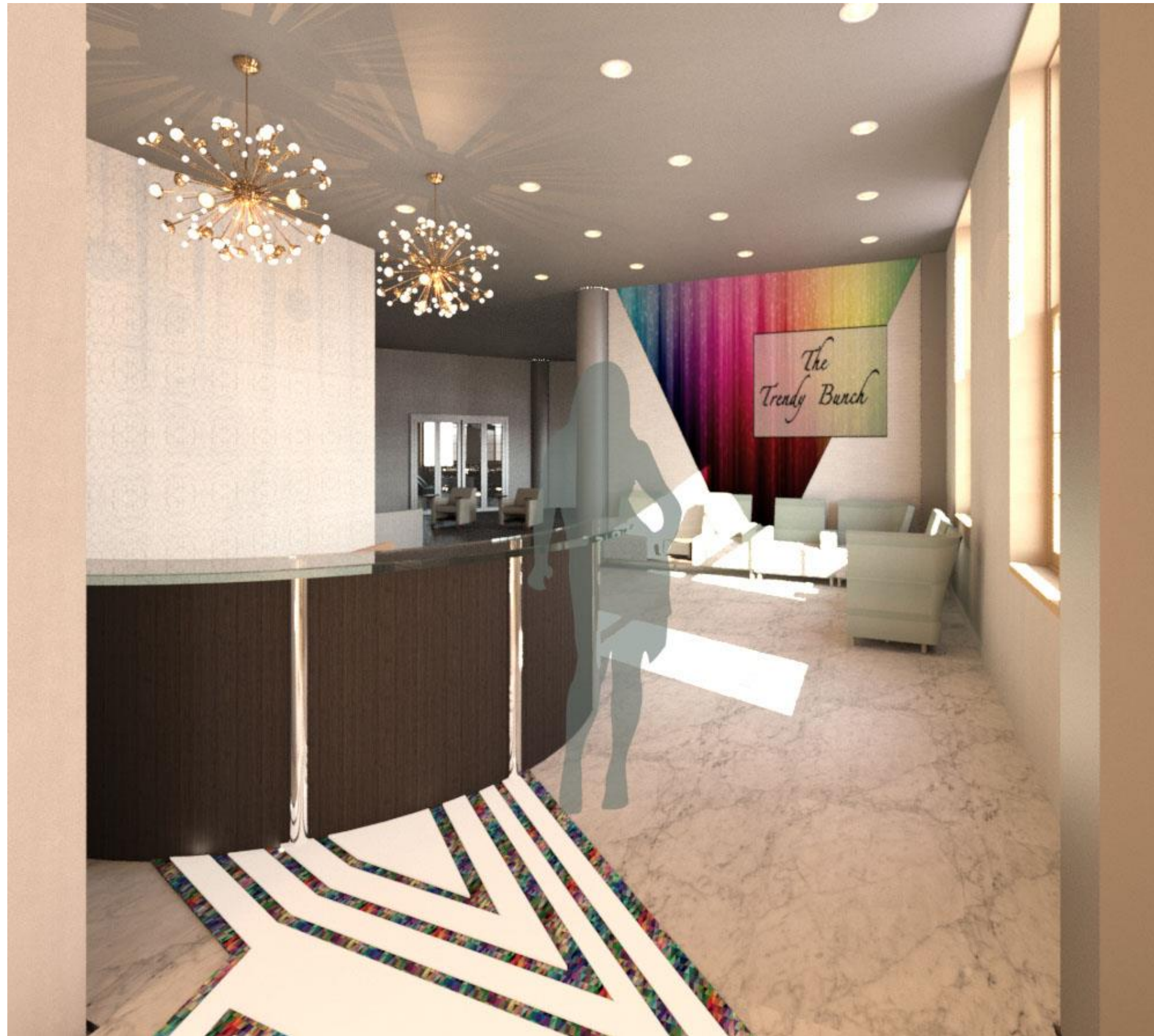
Rendered Reception Area