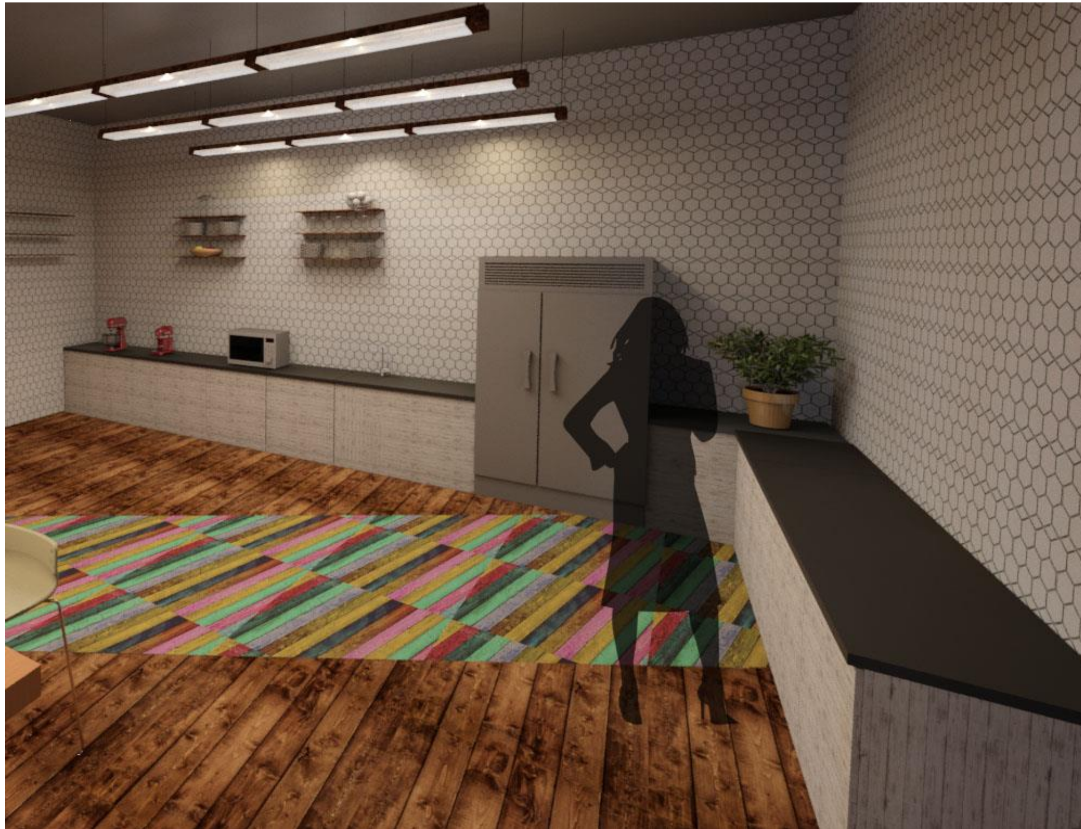
Rendered Commercial Kitchen