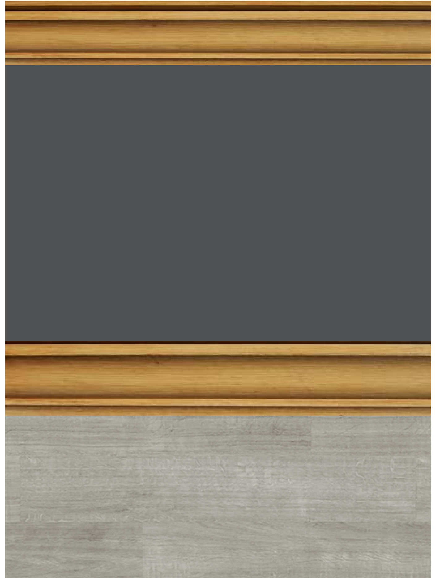
ARCHITECTURAL FINISH OPTIONS