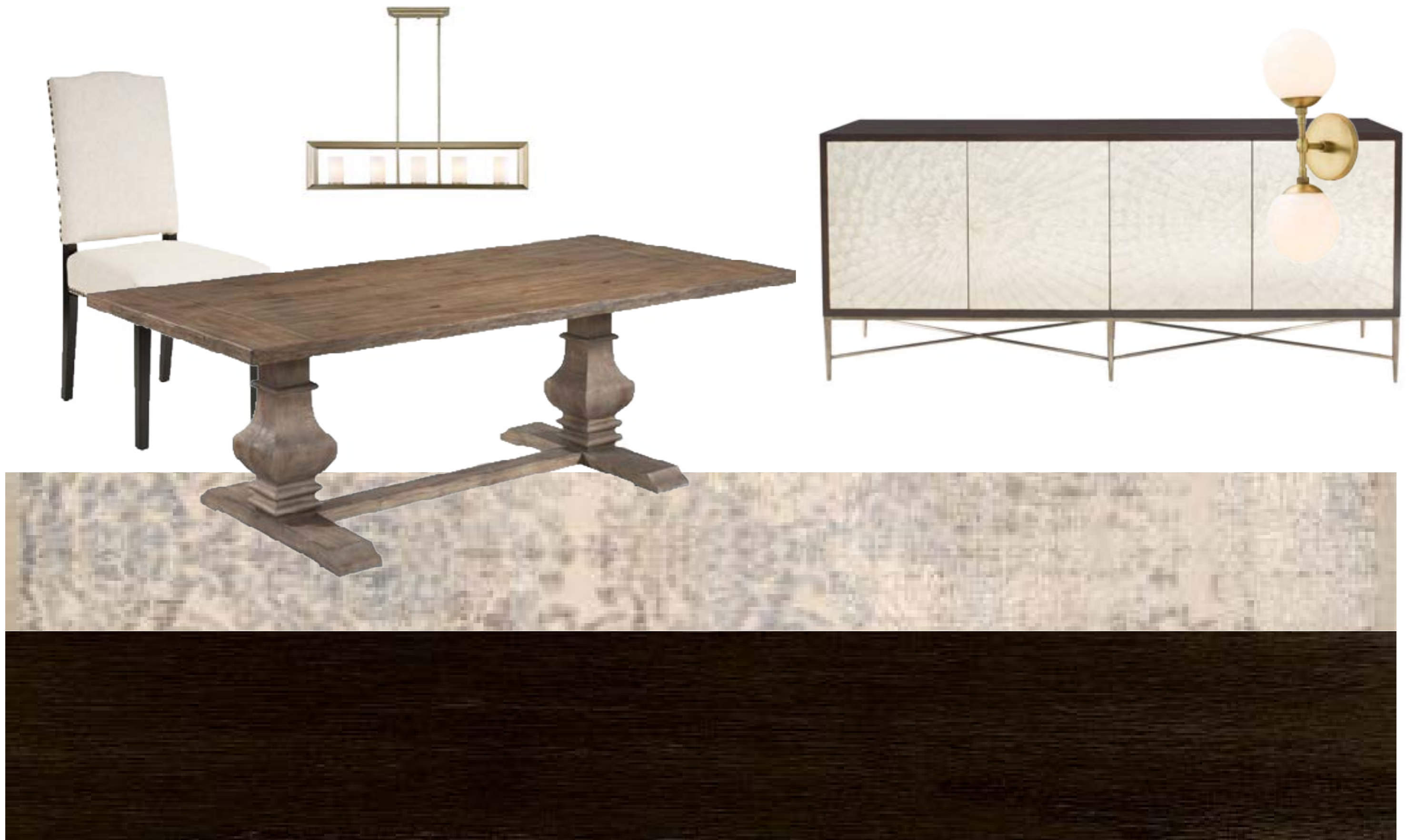
FURNITURE & FINISHES DINING ROOM