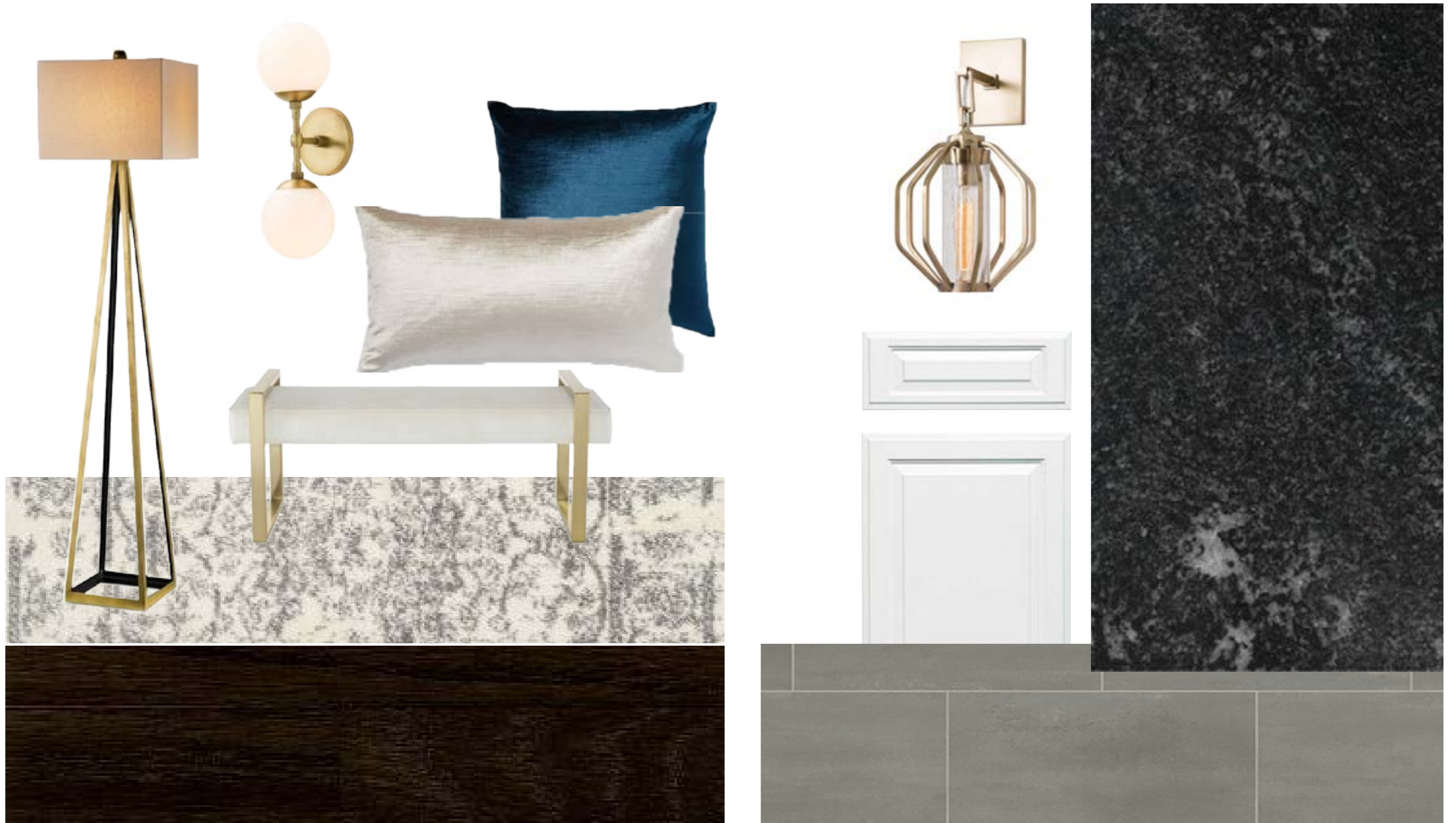
FURNITURE & FINISHES MASTER BEDROOM/BATH