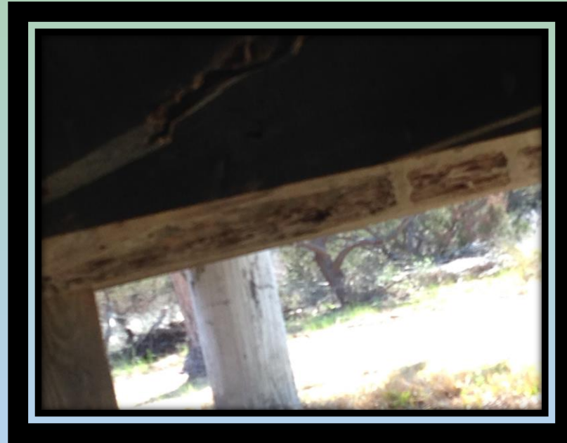
Unstable foundation and decaying beams