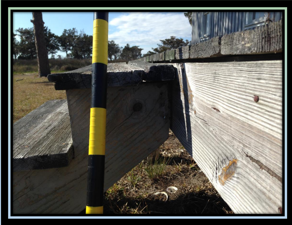
Back porch stairs not secured to porch itself