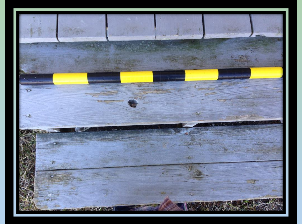
Stairs on front porch greening and rotting