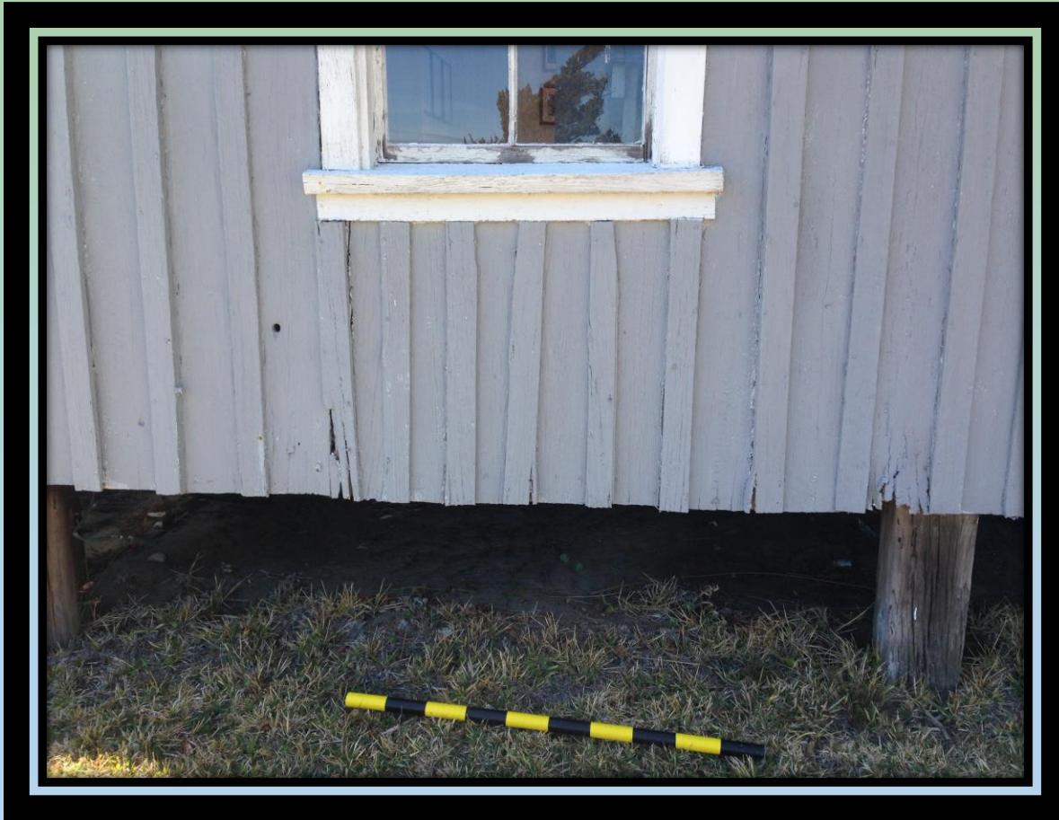
Wood rot around the trim and roof supports