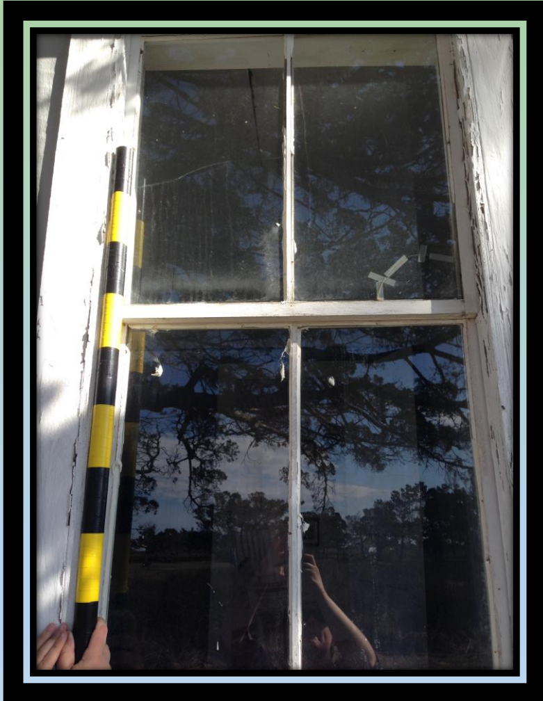
Two broken windows