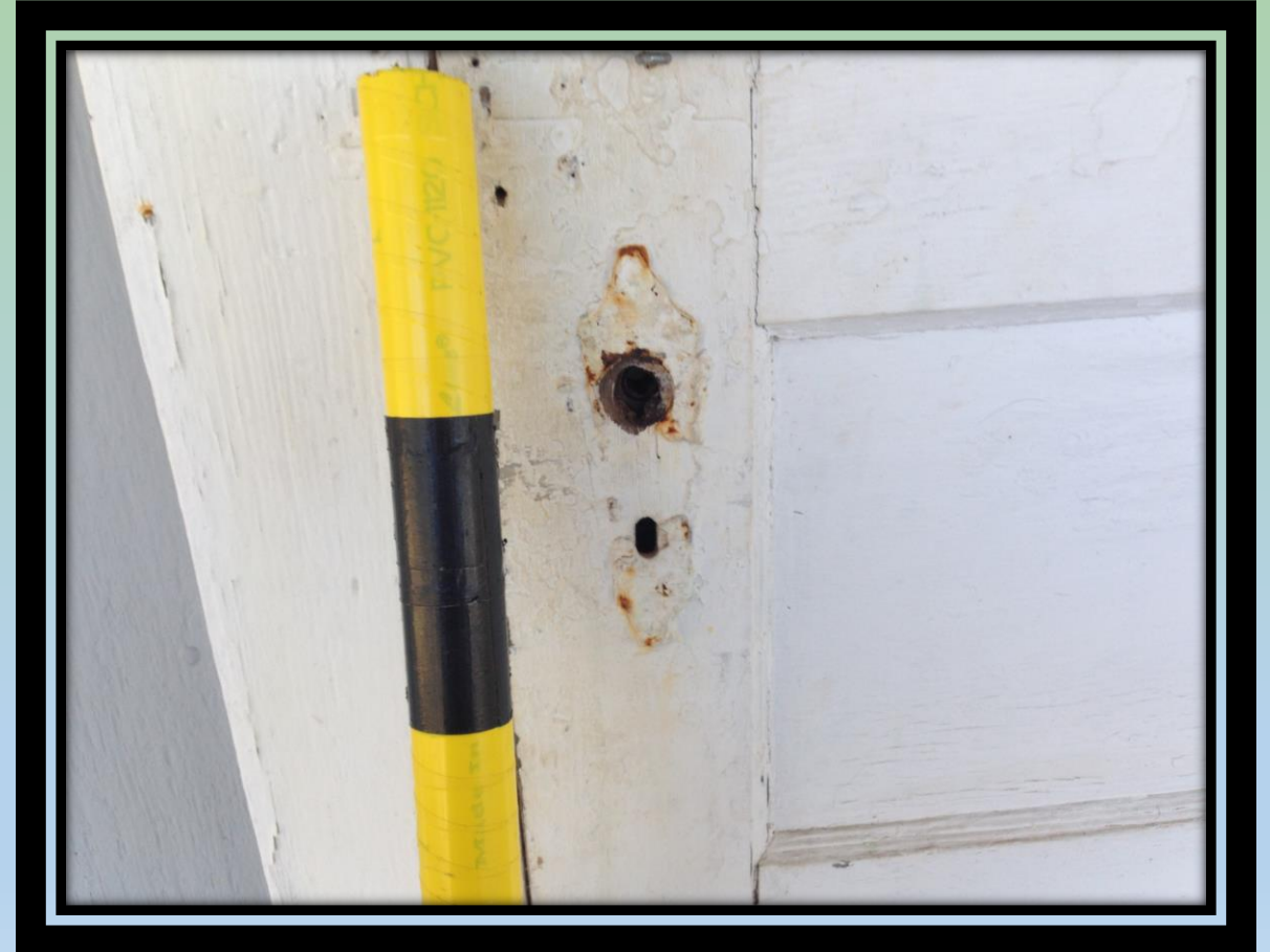
No handle and rusting throughout