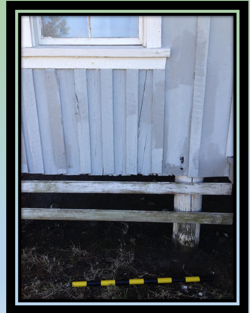
Some areas in need of repainting